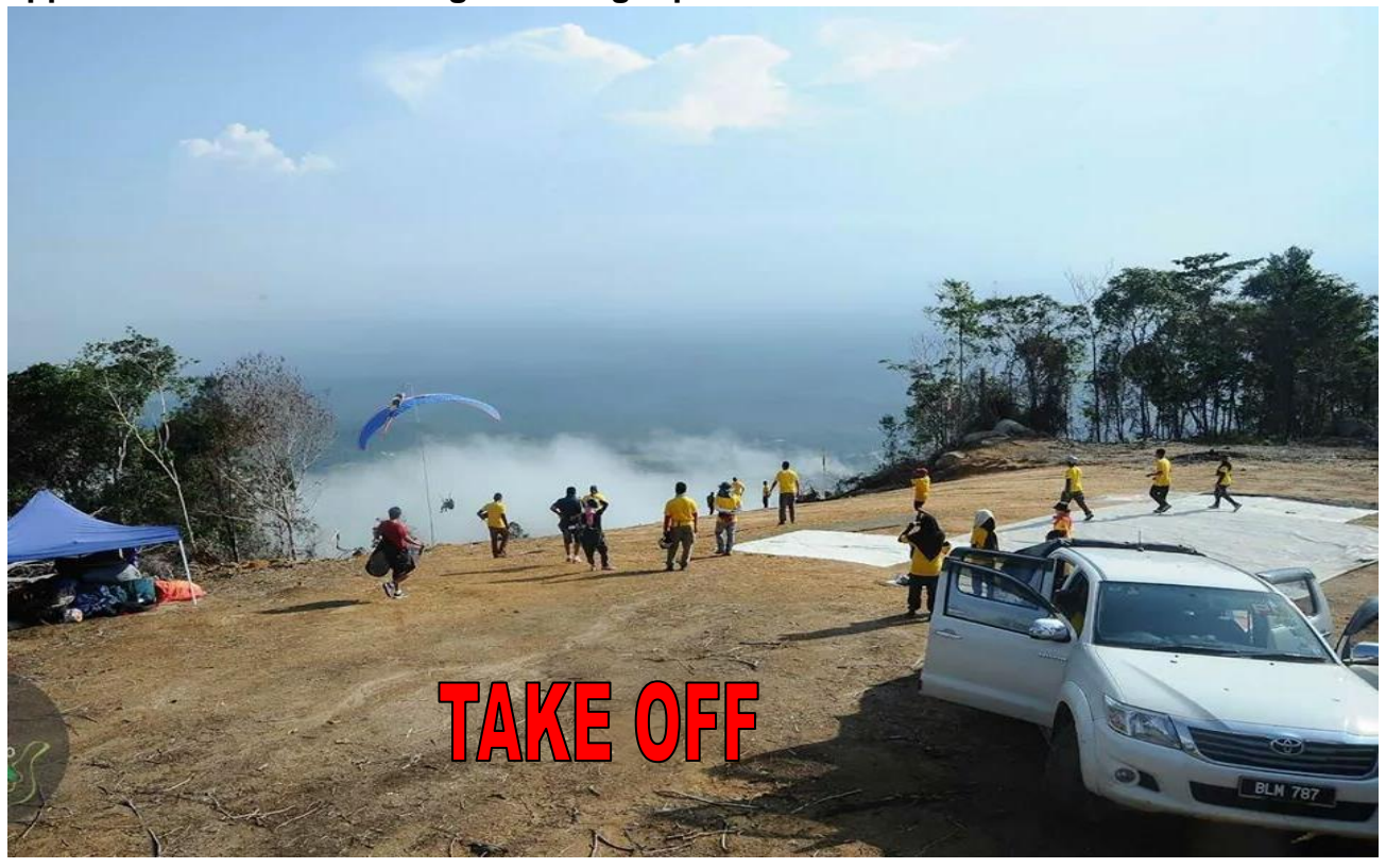
Take off: 3°33'31" (3.5588)N; 101°40'40" (101.678)E - Elevation: 426Meter The TO situated at 1,400ft ASL facing South, South-West Accessible by car from LZ.